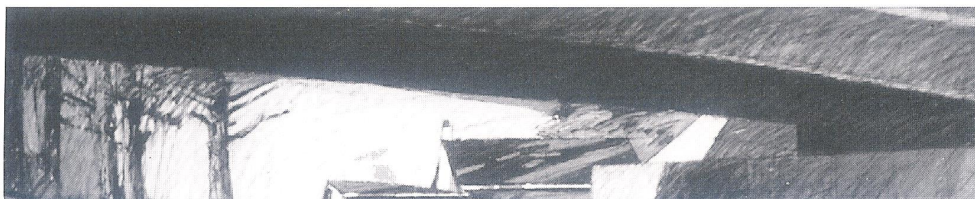
top left flowers in front of "Karin's Gift", mixed media, 1996 80x52 inches artist: mark e. flowers

"My pictures are slices cut from a continuum. . . Every season of discovery is included - from the poetic to the austere serene," Gibson said.